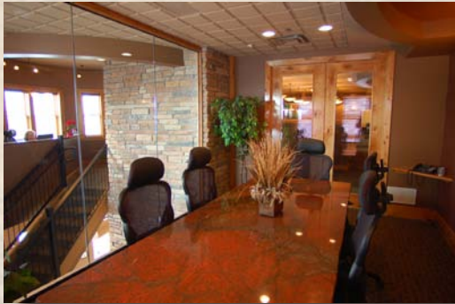
Glass Conference Room